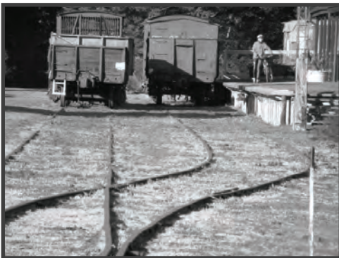
Domino Trail, Trentham Station

Free Spa Country Explorer A4 local maps are downloadable from SpaCountryExplorer.org.au